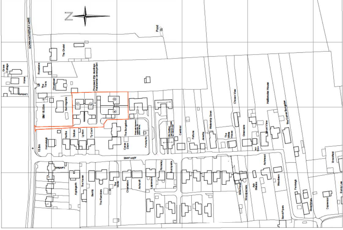
PROPOSED LOCATION PLAN Scale 1:1250