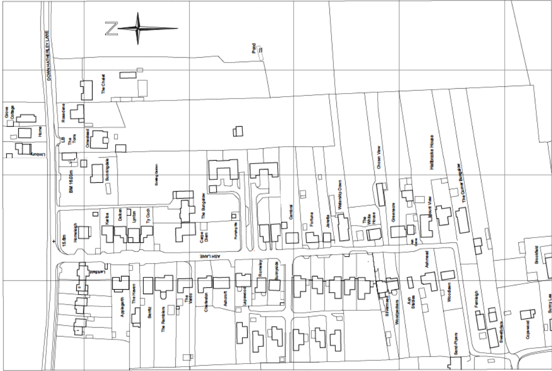
EXISTING LOCATION PLAN Scale 1:1250